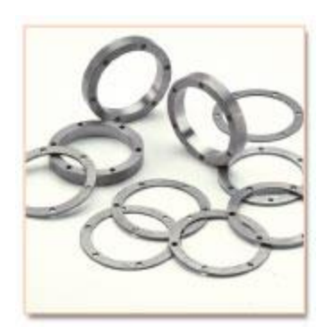
The use of shims allows mounting flange to ring gear dimensions to be adjusted to fit non SAE dimensions without costly flange adaptors.