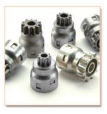
Pinions for all SAE standard and most Metric ring gears.