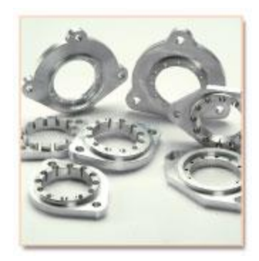
Machined flanges allow new flanges to be available in days, not months.